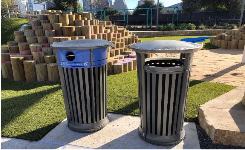
Poe Landscape Forms receptacles at Butler Metro Park

Following Zilker Metropolitan Park, the next metro parks for recycling implementation will be Roy G. Guerrero Colorado River Metropolitan Park, Circle C Metropolitan Park, Commons Ford Metropolitan Park, and Walnut Creek Metropolitan Park. Recently completed park projects that received new receptacles include Colony Park District Park, Eilers Neighborhood Park, Ricky Guerrero Park, Little Stacy Neighborhood Park, Montopolis Recreation Center, Walsh Boat Landing, Georgian Acres Neighborhood Park, and Veterans Park.