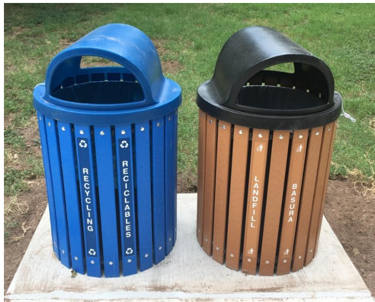
New Max-R receptacles with bilingual labels and two-way dome lids