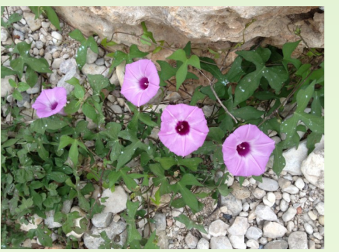
Lindheimer's Morning Glory

There are many great places to trail run in Austin. Some favorites are the Hill of Life, Rudy's Loop, Bologna, the Hill of Death, the Superhighway (the Barton Creek Greenbelt), as well as St. Ed's, Walnut Creek, and Bull Creek. A great source for trails in the area can be found at http://www.austinridgeriders.com/trail-listing.