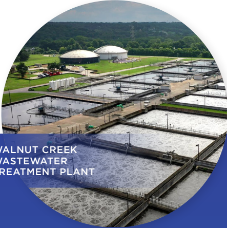
WALNUT CREEK WASTEWATER TREATMENT PLANT

AUSTIN WATER | 2025 WATER & WASTEWATER RATE ADJUSTMENT