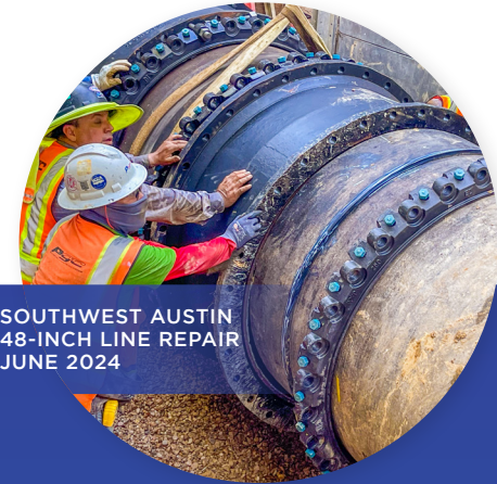
SOUTHWEST AUSTIN 48-INCH LINE REPAIR JUNE 2024