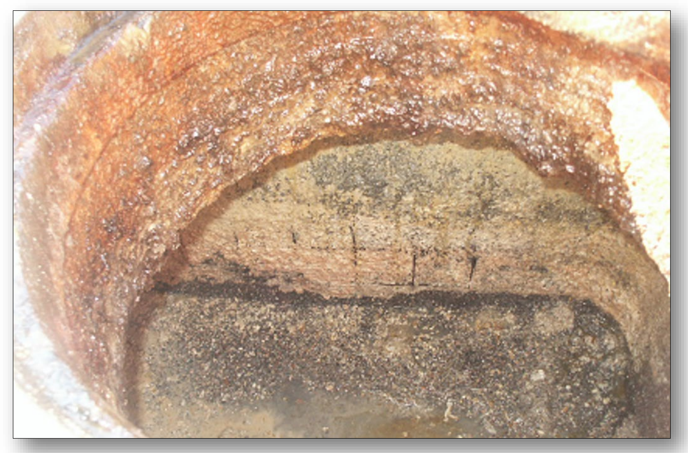
Notice the black lines on the tank wall of the trap shown above. This is exposed wire rebar.

These acids are very destructive and over time can cause baffles, piping and tank walls to simply crumble apart.