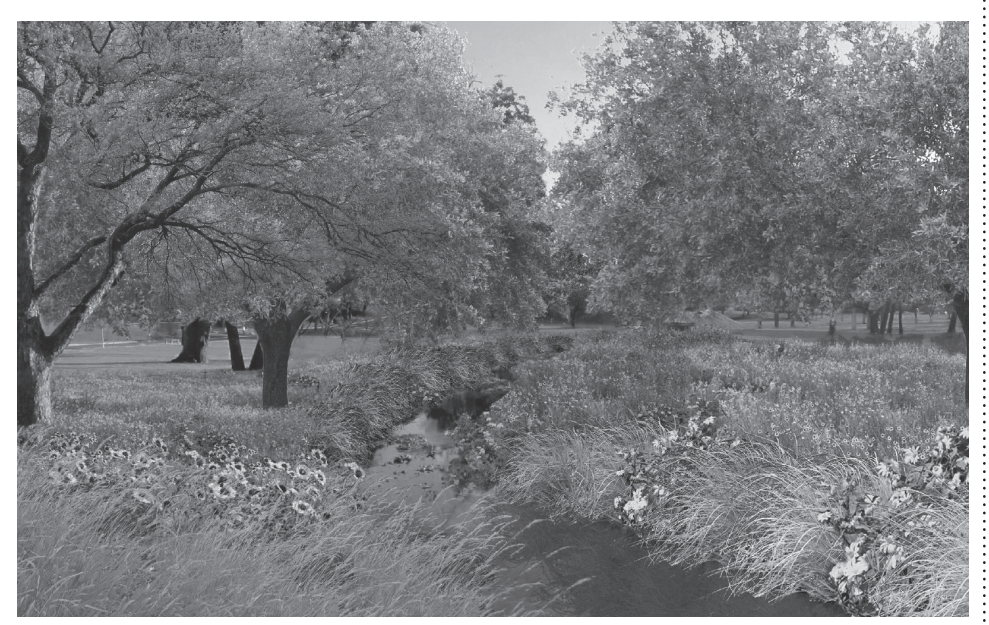
Tannehill Branch project will create riparian parkland and woodland corridor

The project will remove a road that was cut through the park in the late 1960s to accommodate traffic from Robert Mueller Airport. Removing the roadway will create a unified park that has been divided for more than 40 years. It will bring the neighborhood together by creating a unique sense of place for the community to reconnect with the creek.