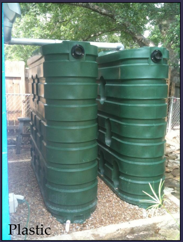
can also be underground