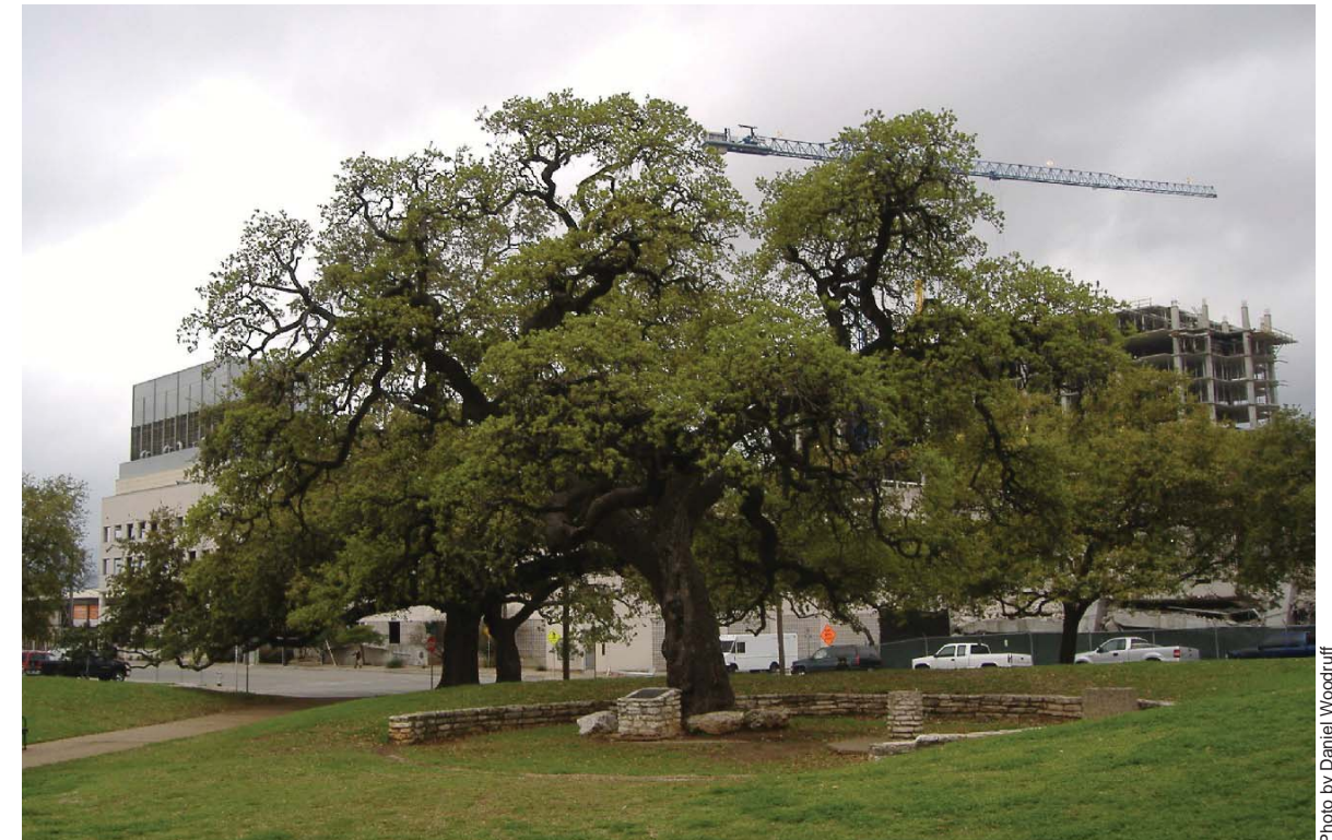
View of “Auction Oaks” prior to recent improvements.