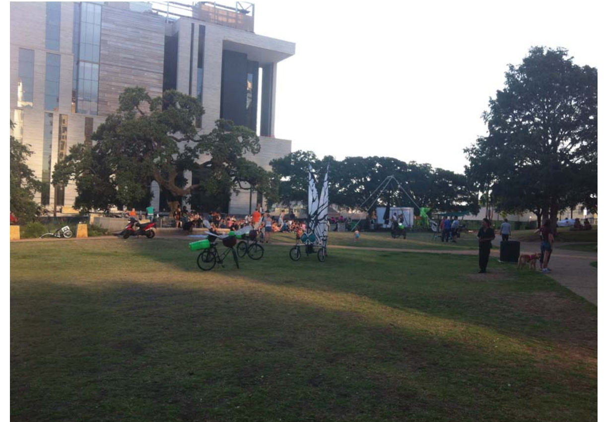
The Park hosts a wide range of events throughout the year.