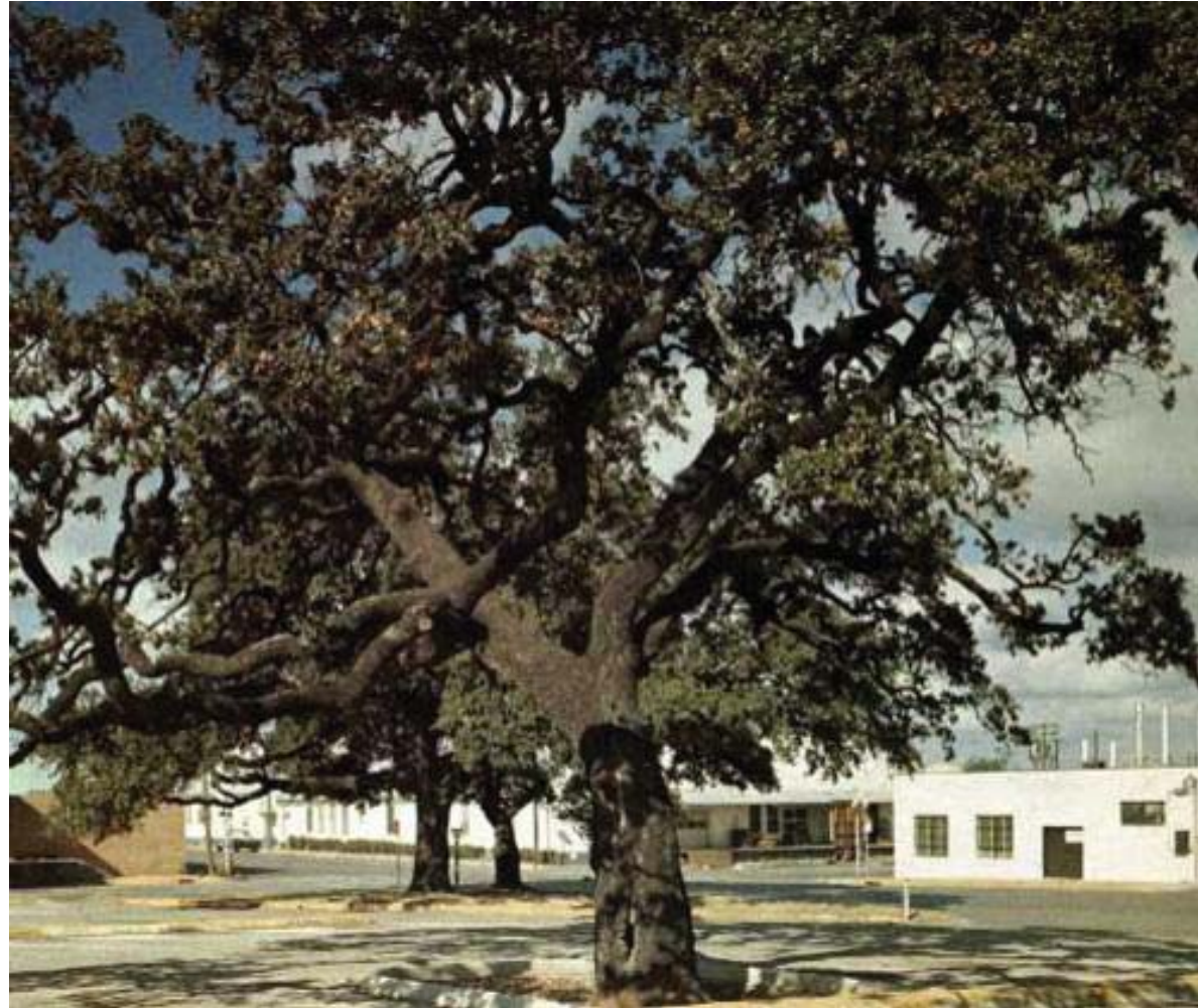
Photo of "Auction Oaks" within parking lot, circa 1960.