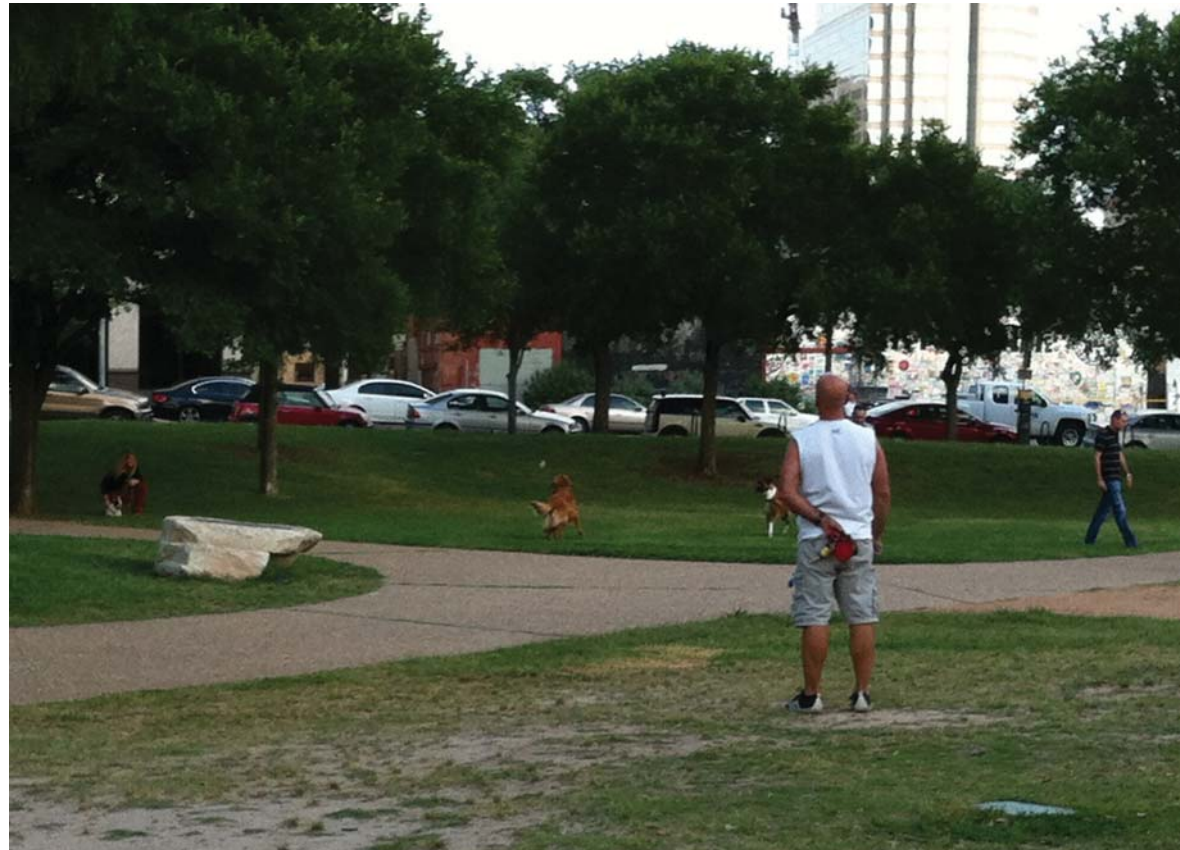
Park use during the week is dominated by nearby residents and their pets.

Recent transportation planning around the Park has added a new and complex layer of activity. Effectively planning for such activity involves more than just installing a sidewalk along the edge of a busy street. It requires the careful creation of an environment that suits walking, bicycling, and transit, and it requires planning for speeds that allow for mobility and commerce while providing safe environments for pedestrians and bicyclists. Importantly, planning for urban parks should also consider the economic health of adjacent land uses and help plan for potential development and redevelopment that enhances the economies of local communities.