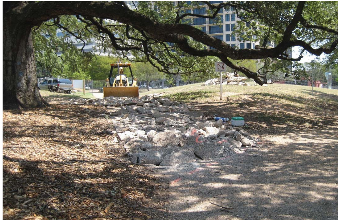
Demolition of sidewalks and flat work beneath “Auction oak” trees as part of recent improvements.