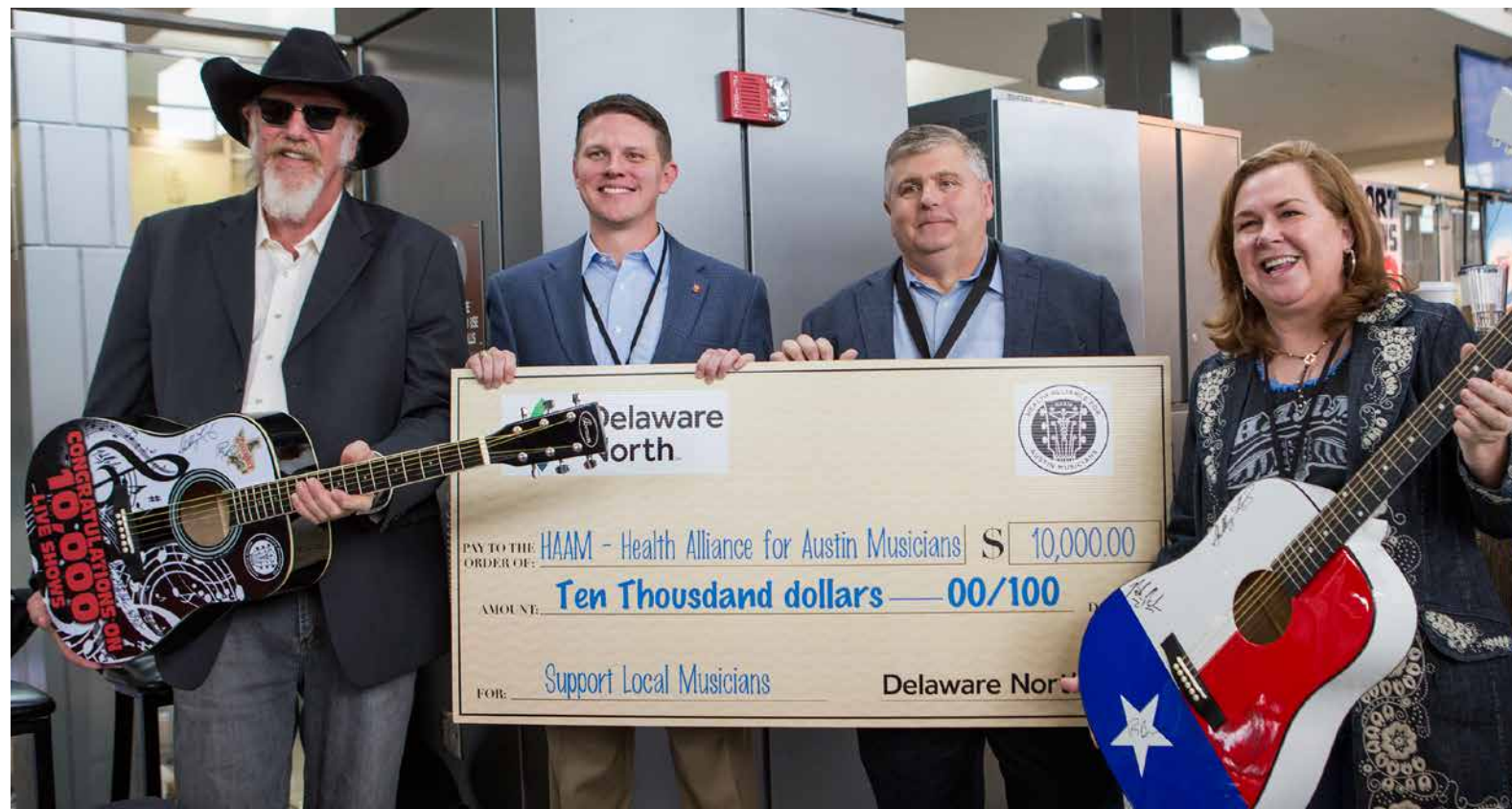
Airport concessionaire and live music sponsor Delaware North Companies (DNC) presented HAAM (Health Alliance for Austin Musicians) with a $10,000 donation. Grammy winner Ray Benson, front man of Asleep at the Wheel, performed along with an Austin all-star lineup.

All live music venues of the airport are located past security checkpoints accessible to ticketed passengers only, currently an audience of approximately 30,000-36,000 passengers each day.