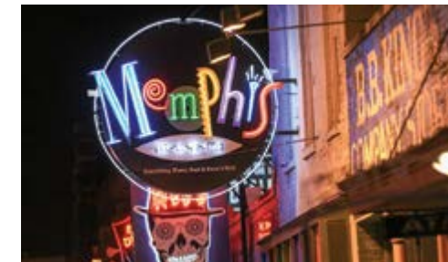
Brand USA/Memphis Convention & Visitor's Bureau

The Austin airport has experienced significant growth of service by Allegiant Air. As recently as June 4, 2015, Allegiant launched nonstop service between Austin and Cincinnati. Starting February 2016, the Austin-Cincinnati route will be offered year-round. The latest flight addition now includes an Austin-Memphis nonstop route which began in October 2015.