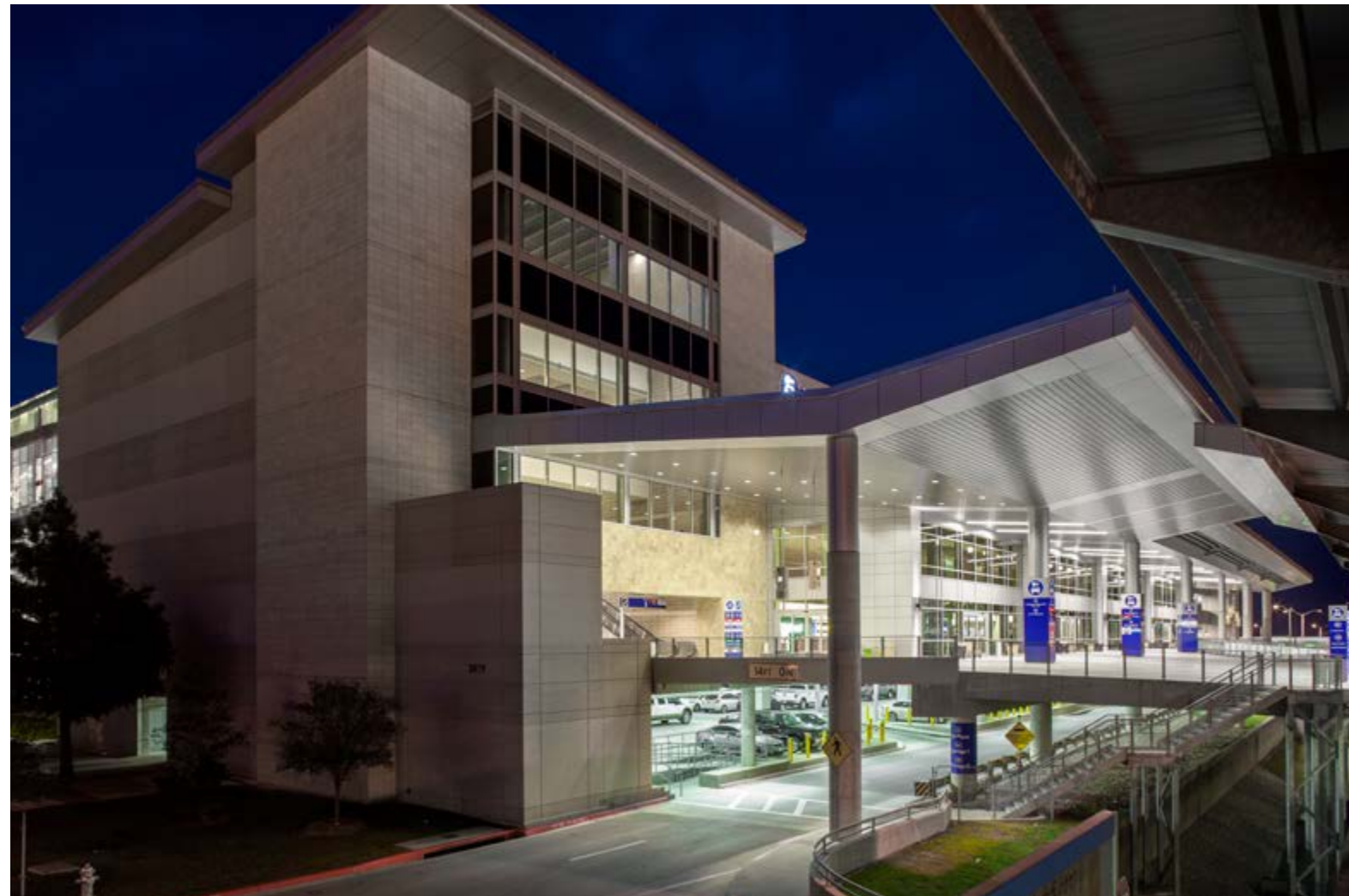
CONRAC is a new five-level, 1.6 million square foot complex that consolidates all rental car operations, including vehicle pick up and drop off, car storage, cleaning, and fueling into a single facility.

Moving rental vehicles to this facility opened up about 900 of the closest parking spaces to the airport terminal for the traveling public on the top level of the garage. Another parking improvement provided by the Rental Car Facility, its completion transformed what once was part of an open air lot, Lot A, exposed to the elements, into a new parking garage with about 800 covered spaces.