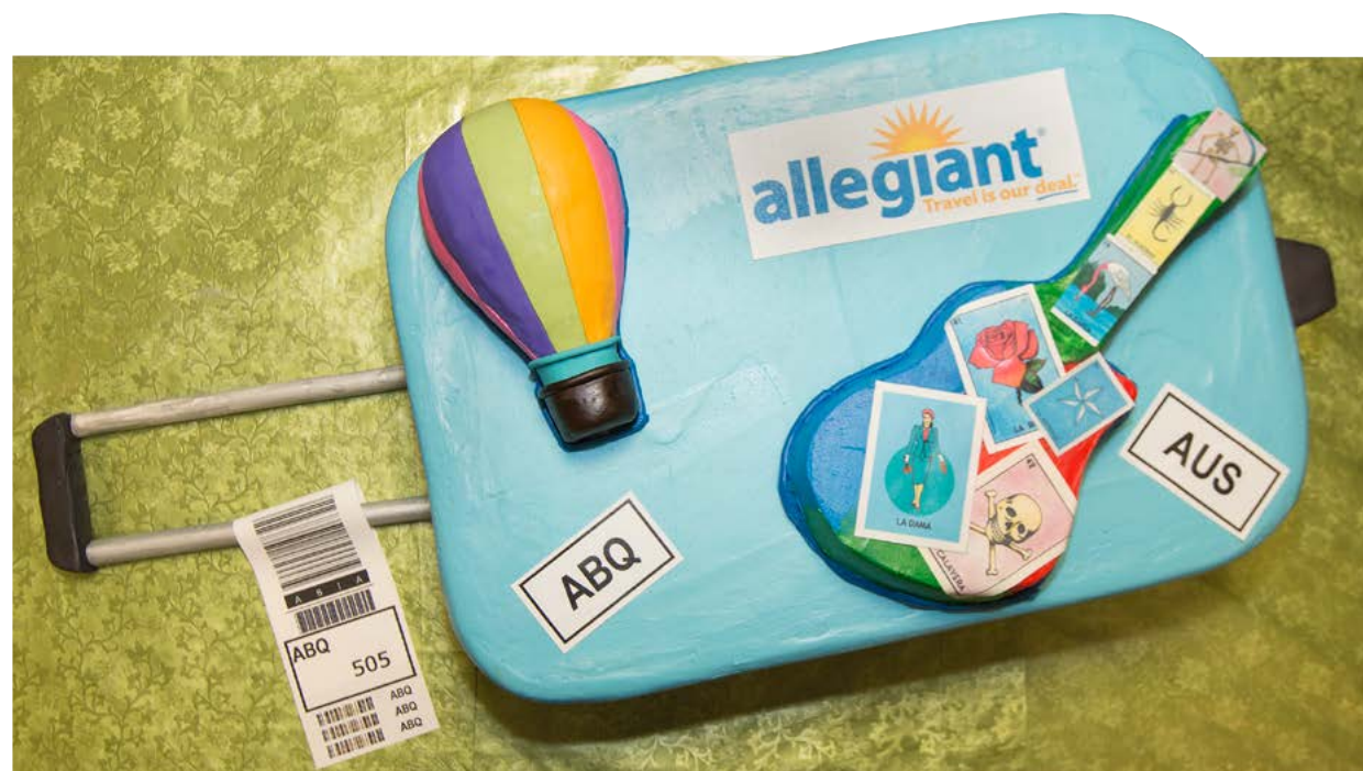
The launch celebration featured a cake in the shape of a suitcase with a guitar representing Austin for its live music and a hot air balloon for Albuquerque, the host of the largest hot air balloon festival in the world.

Flights and lowest fares can be found only at www.allegiant.com