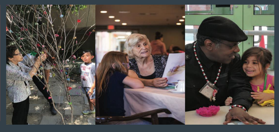
Optimizes shared space in public places.

Addresses the care needs of multiple generations all in one place with potential cost savings.