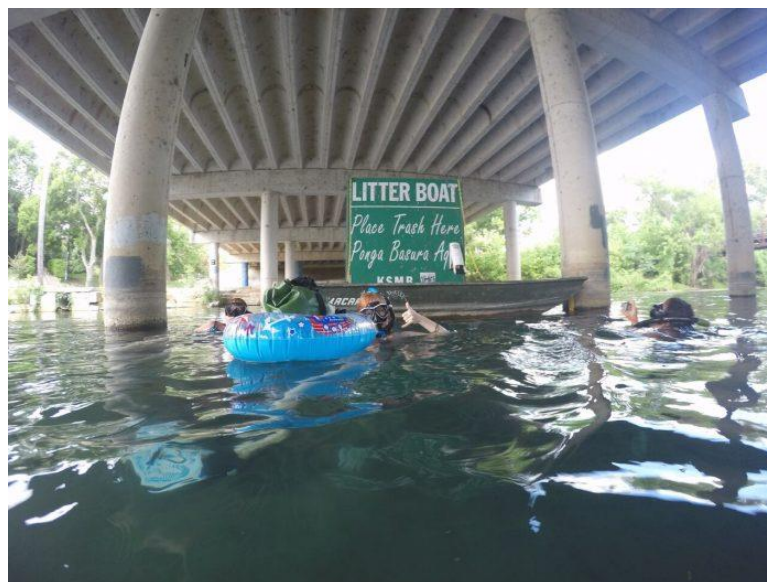
Figure 13. Litter Boat in San Marcos, Texas

The simplest device to prevent trash from becoming litter on Ladybird Lake requires boaters to deposit their trash in a receptacle on the waterway itself. The City of San Marcos, Texas, deploys “Litter Boats” on their rivers during high use periods (Figure 13). Logistics to be considered include locations to avoid restricting boat traffic and maintenance requirements; San Marcos reported emptying boats several times a day during weekends and holidays (Amy Thomaides, City of San Marcos, pers. comm. 5/2/2022). This type of device is only applicable where people are recreating in the water without easy access to land-based trash receptacles.