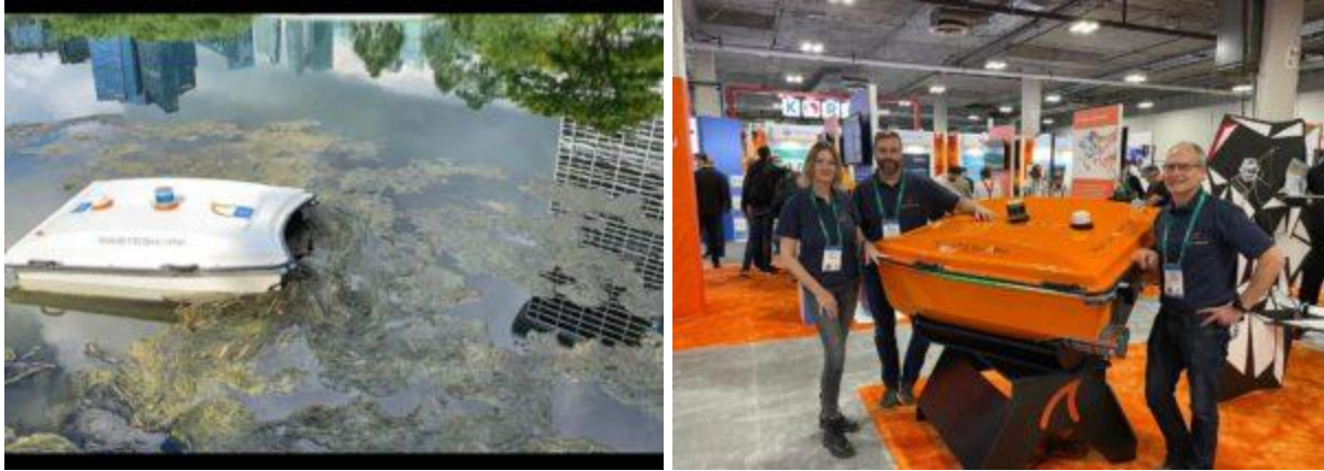
Figure 6. Waste Shark Aquatic Litter Robot and photo to show scale

Clear Blue Sea, a nonprofit based in Australia, has developed several solar powered prototypes of a “ FRED ” (Floating Robot for Eliminating Debris). They plan for FRED to be designed to be scaled up, modified, or replicated by anyone interested in improving marine waters. It is currently being piloted, but their plan is that it can be successfully constructed with readily available commercial products, and they will provide the design. Another nonprofit, the Urban Rivers program, has a prototype aquatic trash robot , but software issues and maintenance have been ongoing problems; their plan was that it could be controlled remotely by users online. They have concerns with vandalism and the loss of the robot, thus the implementation of a safety tether and a virtual GPS cage which will limit the area that can be served.