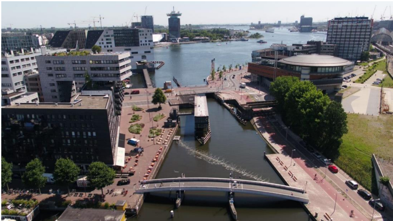
Figure 9. Bubble barrier diverting flow to Containment Trap, Netherlands

“Based on the results of the pilot at Deltares research institute, it has been calculated that the Great Bubble Barrier captures approximately 70-80% of top-surface floating plastic and 50% of plastic underwater. During the tests in the IJssel we looked at how these results translate in a river. We tested our Bubble Barrier at the IJssel in various weather conditions and came to the conclusion that it caught 86% of the (floating) test material. We can catch plastics with a size of 1mm and bigger, like granulate and Styrofoam. In the pilot at Wervershoof, we are investigating whether we can catch microplastics measuring 20 micrometers up to 500 micrometers (0.5 millimeters).”