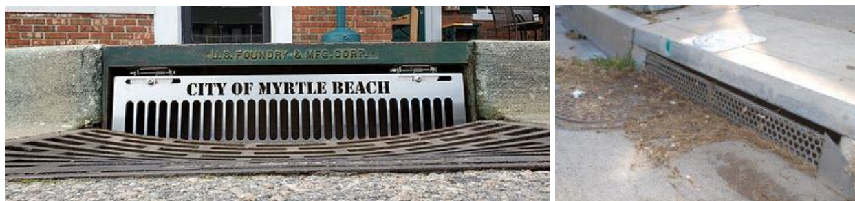
Figure 10. Custom Curb Inlet Guard, Myrtle Beach and BioClean Curb Guard

One additional type of inlet protection are trash guards or curb inlet screens. Curb inlet guards simply block trash from entering curb limits with screens or flaps (Figure 10), costs start at $1,000 to $1,500 per inlet for 3-5foot inlets. Curb inlet guards differ from inlet filters as they do not capture or retain the trash, but rather allow stormwater to enter while blocking litter that is then washed down gradient along the street curb, thus avoiding clogging. They were evaluated in California as an alternative to having to provide full capture for trash reduction and achieved a 63–78% reduction in trash (Fusco & Fons, 2019). While these are a low cost retrofit, they must be used in conjunction with a rigorous street cleaning program to collect the litter before entering the waterway through another path. Their benefit is exclusion of trash from inlets, while reducing maintenance difficulty. The disadvantage of these devices is that the street litter would remain visible until cleaned and may just move litter to another location downgradient of areas with inlet protection.