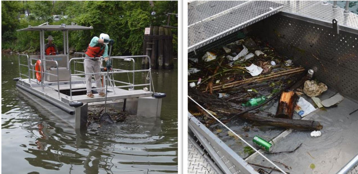
Figure 1. Elastec Omni Catamaran skimmer boat with collector bin

can inform whether more of these devices should be deployed in creeks to concentrate trash for cleanup. From October 2021 through July 2022, the Lady Bird Lake crews have removed more than 18 tons of waste material. WPD Field Operations Division uses a combination of in-house crews, contractors, and partnerships to provide vegetation and litter management at 1400+ combined acres of WPD-maintained assets such as ponds, creeks, channels, and open space properties including over 1,200+ stormwater controls.