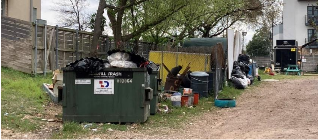
Figure 15. Trash Area of Food Trailer Court ( Photos from Juniper St., East Austin, TX )

Some areas tend to have a plethora of litter due to their role as transition areas, where citizens are moving from into an area where smoking, beverages, or food are not allowed. Parking lots of secondary schools and to-go food establishments are areas where trash needs to be discarded and frequently the bins are inconvenient (more than 30' spacing) or overfilled. Schools should be encouraged to maintain their parking areas and bus stops. The City of Austin could work with Austin Independent School District (AISD) to promote environmental efforts from their students. Education programs discussed in the following section would recruit student participation.