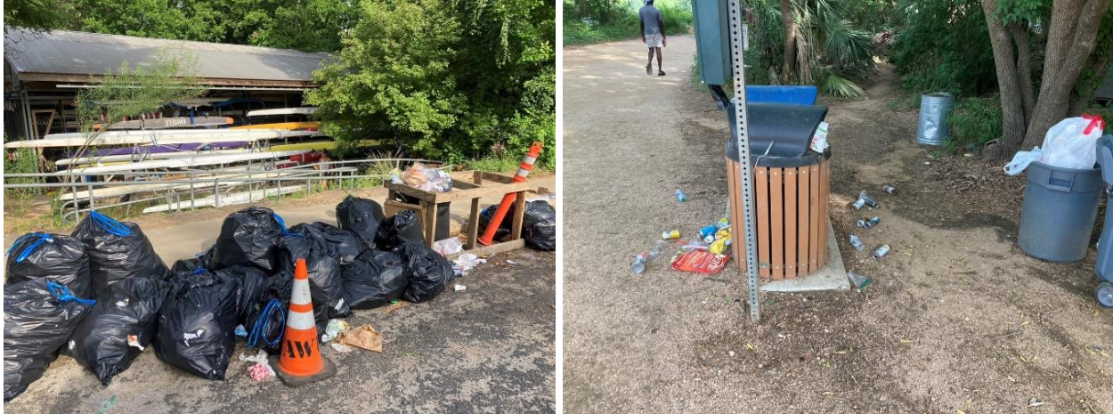
Figure 12. Trash near paddling concession, Lady Bird Lake (left) and PARD trash cans near paddling concession (right) (location Stephen F. Austin Drive near Austin High School)

Concessionaires on City of Austin land could also be required to provide litter bags to customers. Litter bags could also be provided by Austin staff during “Leave No Trace” education events. The Missouri Department of Conservation’s Stream Team Program , provides mesh trash bags to river recreationists, including through canoe-rental operations as part of their “Stash Your Trash” program. The program has an annual operating budget of $80,000 for the purchase of mesh bags to be distributed free of charge for the states more than 1.3 million visitors a year.