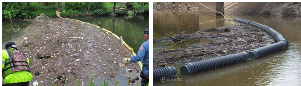
Figure 3. Trash booms and maintenance crew

circumvent retention during high flows. Booms can also be used to maneuver debris to a passive collection device. Some booms are designed to have a disconnect feature for high flow conditions such that they can be simply reattached rather than lost downstream. Issues in deploying booms include the aesthetic impact of accumulated debris between maintenance intervals, the loss of collected debris in high-flow conditions, and the access within waterbodies required to manually remove trash.