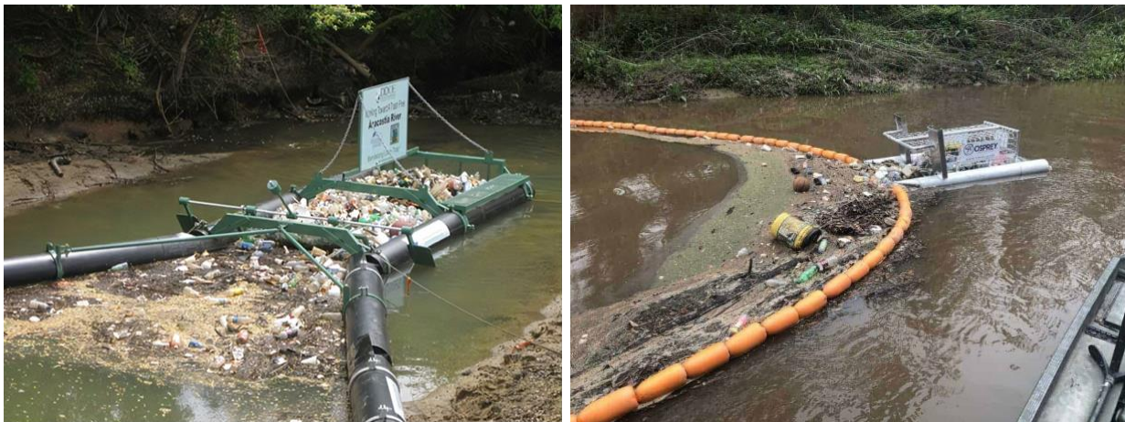
Figure 5. Booms directing Floatables into Trash Traps ( Photos courtesy of Bandalong and Elastec )

The more robust group of devices for collection within or at the mouths of creeks function by passively allowing stormwater to carry the litter and debris into a trash trap device, usually a metal trap or mesh, or other sturdy material, that does not impede flow while collecting debris. Frequently booms are used to funnel floating debris to devices that are narrower than the creek width (Figure 5). The devices basically screen the debris and allow the water to flow through. Most of these devices are quite costly (Table 3) with potentially high maintenance costs, and in some instances where large watersheds are served, they are part of a much larger structure. Many cities install devices and soon revert to contracting with the manufacturer for maintenance.