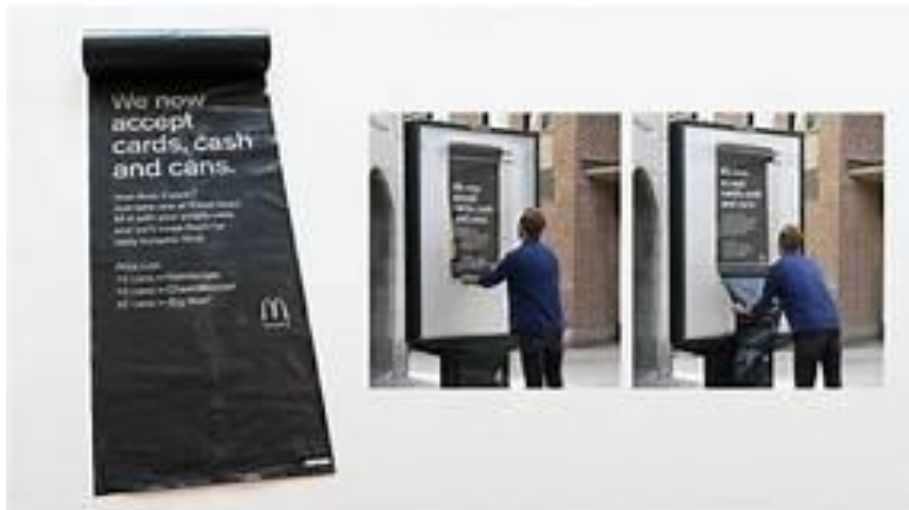
Figure 19. McDonalds Stockholm, Food for Cans

Texas unsuccessfully attempted to introduce a bottle bill in 2011, 2013, and again in 2015. The bill set a redemption goal and deposit rates. Containers made of glass, plastic or aluminum with a capacity of 4 L (1.1 U.S. gal) or less would have been covered. The Texas bottle bill did not gather enough votes ( https://en.wikipedia.org/wiki/Container_deposit_legislation_in_the_United_States#Repealed_legislation and https://www.bottlebill.org/index.php/past-campaigns/texas-past-campaigns accessed February 10, 2022). One interesting alternative are machines that entice recyclers to deposit beverage containers for the chance to win a prize, point cards or cash. Tomra Reverse vending (tomra.com) is a company that works with retailers where container deposits are accepted, but also could be used at those transition points on the watershed surface that collect large volumes of litter. And in another example, a McDonalds in Stockholm lets you pay for food with recycled cans (Figure 19).