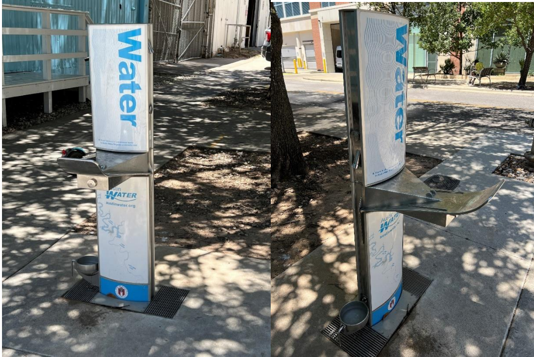
Figure 18. Austin Water new water stations (at Trinity St. and E. Cesar Chavez St.)

Although the alternative of reusable water bottles and fill stations is a simple solution, in some instances, they are more inconvenient. The discard of plastic water bottles is ubiquitous on Austin’s trails and high pedestrian traffic areas. Incentives for travelers to use reusable bottles is an area that needs to be investigated. Tourists use around 30 plastic bottles per person for a two-week trip . Perhaps large events that attract large numbers of participants, like SXSW, could be encouraged to supply both refillable bottles and large drinking water containers in event areas.