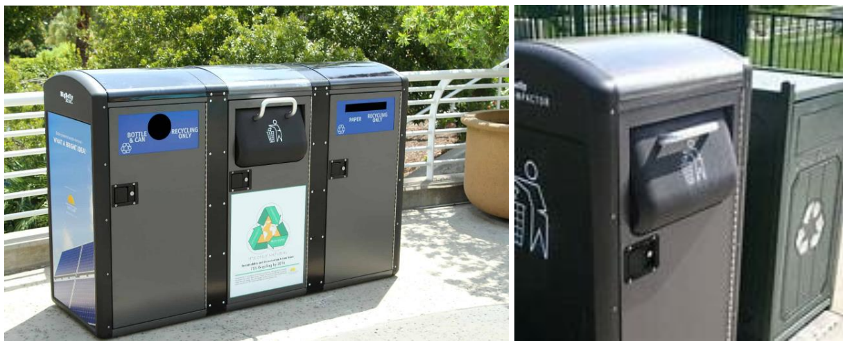
Figure 14. Solar Powered Compacting Trash Cans

Compacting trash receptacles are devices that have been incorporated in some programs because of their ability to contain 6-8 times as much waste as a regular bin (Figure 14). Austin Resource Recovery (ARR) had a trial of solar powered compacting trash bins on Guadalupe Street due to the problem of overfilling. It was determined that they would no longer be used for two primary reasons. The recycling side filled up quickly, but because of the nature of mixed recycling, the compaction was not ideal. The other reason was that ARR crews were already working on a regular fixed schedule, so the added benefit of a trash can that could alert staff when emptying was needed did not fit with routine maintenance. Philadelphia incorporated the installation of close to 1000 solar-powered Big Belly trash receptacles throughout downtown and the commercial district. At a cost of over $4,000 per bin, major modifications to current maintenance programs would be required to offset the cost of the bins with any gain in reducing the emptying frequency due to compacting and directing efforts more towards high trash areas. Another added benefit of compactors is eliminating the ability to scavenge for trash. Two companies were identified that market these, both solar powered, Big Belly and Ecube Labs both offer optimization of bin maintenance and deployment.