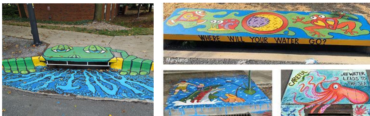
Figure 17. Storm drain Inlet Art

One program that many municipalities have adopted is marking storm drains. Markers or painted signs on storm drain inlets inform citizens that anything discarded in the drains ends up in the creek. Austin has a storm drain marking program that has marked approximately 12,000 storm drains (Figure 17). This program educates citizens that the items that enter the inlets do not go to a treatment plant, which can be a perception for people from areas with a combined sewer system, that route stormwater and sewage to treatment plants. While these older combined sewer systems are being phased out, the perception that pipes lead to a treatment plant still lingers. In high tourist areas, more eye-catching graphics might be employed to attract attention and prohibit the casual disposal of items into the storm drains and onto the streets. Japan has a street decorated with a paint that is only visible when wet which brings a surprise element to the flow pathways on the street surface leading to the inlets.