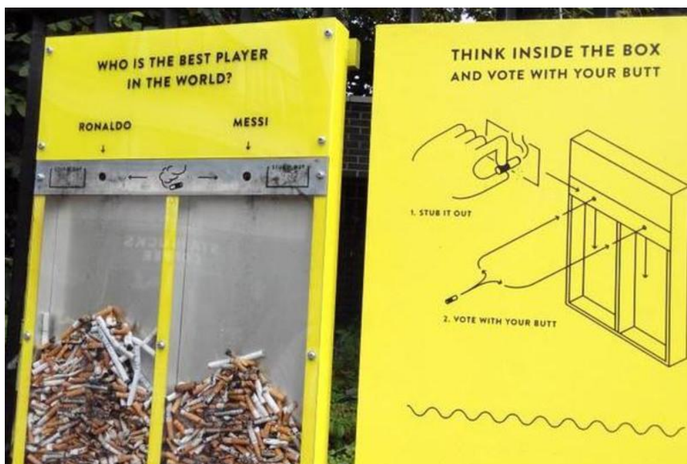
Figure 16. Vote with your Butt London “Neat Streets” project through Hubbub.

Philadelphia also created the “Community Cans” program to place over 50 wire mesh litter cans in the public right-of-way, in partnership with sponsors in commercial districts. Although cleanup at event sites might be sufficient, parking areas such as the Mopac Access Road, north of the river near Zilker Park, and other adjacent event parking areas, might be considered for temporary trash receptacles. Temporary trash receptacles could be coordinated with roadway barrier distribution and pickup after the event. The importance of the provision and maintenance of abundant litter receptacles is emphasized in almost every large city.