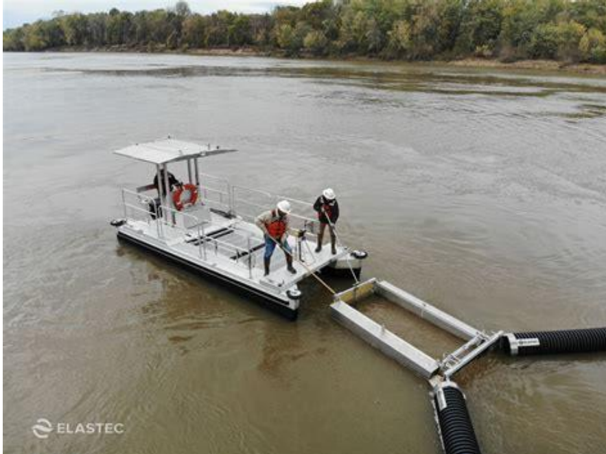
Figure 4. Skimmer Boat Used to Empty Trash Trap

The more robust group of devices for collection within or at the mouths of creeks function by passively allowing stormwater to carry the litter and debris into a trash trap device, usually a metal trap or mesh, or other sturdy material, that does not impede flow while collecting debris. Frequently booms are used to funnel floating debris to devices that are narrower than the creek width (Figure 5). The devices basically screen the debris and allow the water to flow through. Most of these devices are quite costly (Table 3) with potentially high maintenance costs, and in some instances where large watersheds are served, they are part of a much larger structure. Many cities install devices and soon revert to contracting with the manufacturer for maintenance.