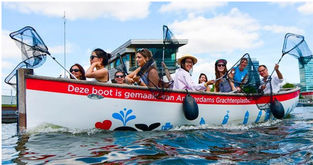
Figure 2. Trash Fishing outing in Amsterdam

Trash Fishing or Plastic Fishing (Figure 2) is a program primarily promoted in Europe. PETA endorses it as a way of protecting aquatic creatures from the hazards associated with litter in water bodies. In the Netherlands and the UK, the efforts have grown from cleanups to constructing a boat from discarded plastics. The Canary Wharf College used plastic fishing materials to build a boat. The Plastic Whale Foundation has a method to distribute equipment for online events, hold school educational plastic fishing trips, and Plastic Fishing tours available for anyone who will purchase a ticket. The proceeds are used in their many efforts including the production of furniture from used plastic in a collaborative effort ( Plastic Whale – Together for a plastic free land & sea ).