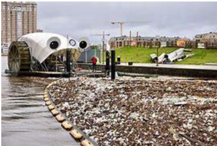
Figure 8. Mr. Trash Wheel in Baltimore, MD

One newly emerging technology to direct litter toward a collection device without obstructing flow uses a submerged air curtain. This curtain of air might overcome constraints where a boom is not feasible, allowing the waterway to remain navigable yet still be able to divert the litter to a collection device or concentrate the litter in a confined area for collection. These devices, like many passive collection devices still rely on the water movement to transport the litter, so they must be placed in a flow-through system. It works by generating a screen of bubbles that block plastics and direct suspended plastics to the surface. The bubble curtain is placed diagonally across the entire waterway and guides plastic waste to the side and into a catchment system. The benefit to this type of system is that it does not obstruct watercraft or interfere with biological life and may actually benefit aquatic life by increasing dissolved oxygen. The