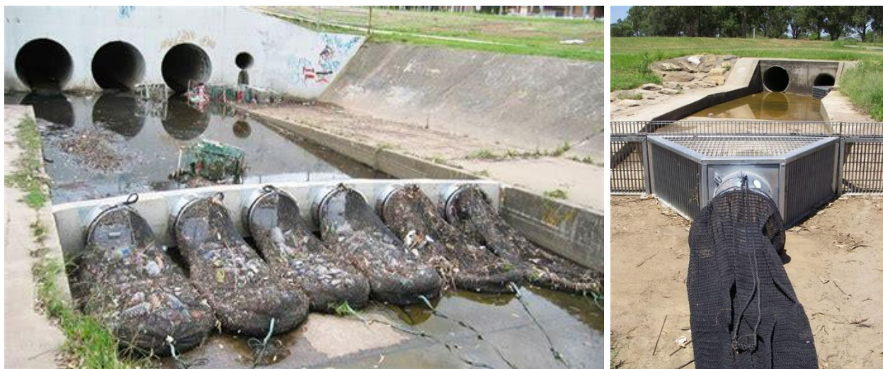
Figure 11. StormX Netting Trash Traps

End of pipe solutions considered by Austin for capturing trash at a pipe or other outfall structure suffer similar problems with clogging/increased risk of flooding, access, and maintenance. An example of an outfall capture device that was evaluated in Austin are netting trash traps, essentially netting bags attached to the pipe (Figure 11). The maintenance can be simple if not desiring to sort trash; the entire filled netting attached to a pipe end is removed and discarded as a whole. The capital is relatively small for the first bag ($5,000 each for those tested in Austin) but since that cost must be repeated for each maintenance event, the long-term costs are enormous.