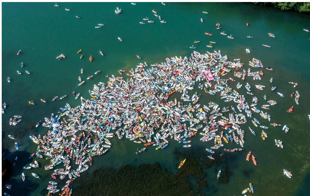
Figure 20. Recreation levels in Lady Bird Lake at Barton Creek confluence in peak use

As the population grows, so grows recreation on Lady Bird Lake (Figure 20), leading to increased littering of single use (glass, aluminum, plastic) beverage containers, discarded clothing, polystyrene coolers, and fishing gear, whether intentionally or inadvertently. Structural controls will not address the problem of litter released directly into the lake, and the City of Austin already has staff dedicated to cleanup of the surface as well as volunteer efforts. Any new and mechanized/robot devices will still require removal and disposal of the materials collected. Prohibition of single use containers (glass, plastic, and styrenes) would yield a significant decrease in some of the materials seen. If the City were to institute rules solely for Lady Bird Lake or the Colorado River within the city limits, restrictions could be published and enforced at concessions that rent watercraft as well as other launch points. An initial effort to educate local citizens with informational booths at launch points and perhaps staff at concessionaires as well and information provided to hotels and other venues could help inform compliance.